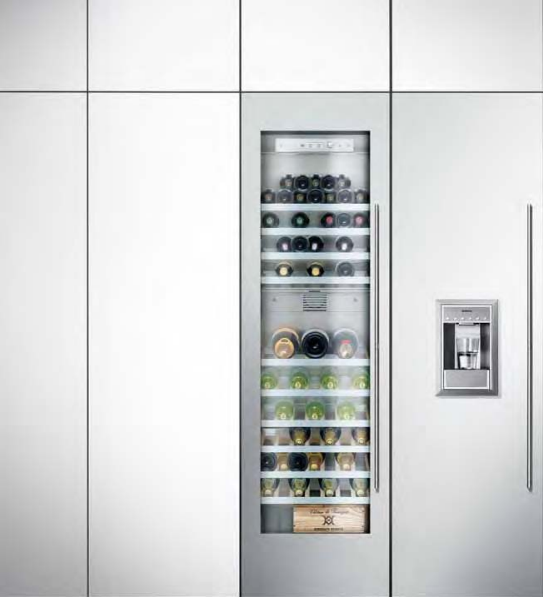
Pictured fitted with Gaggenau aluminium doors (optional accessory). Refer to page 113 for further details. Vario wine cabinet RW 464 (left), refer page 110.